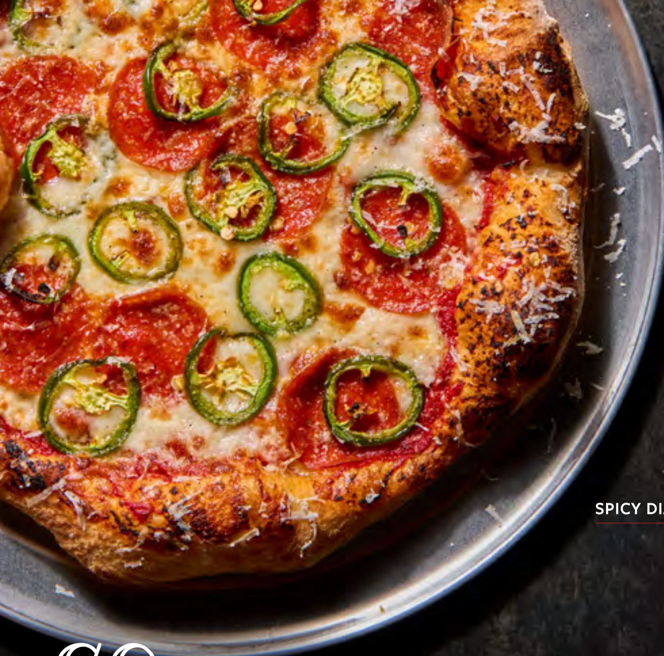
SPICY DIAVOLI PIZZA