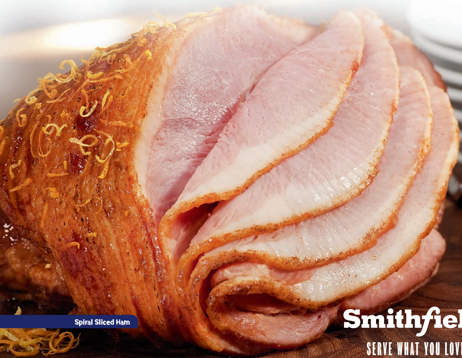
Spiral Sliced Ham