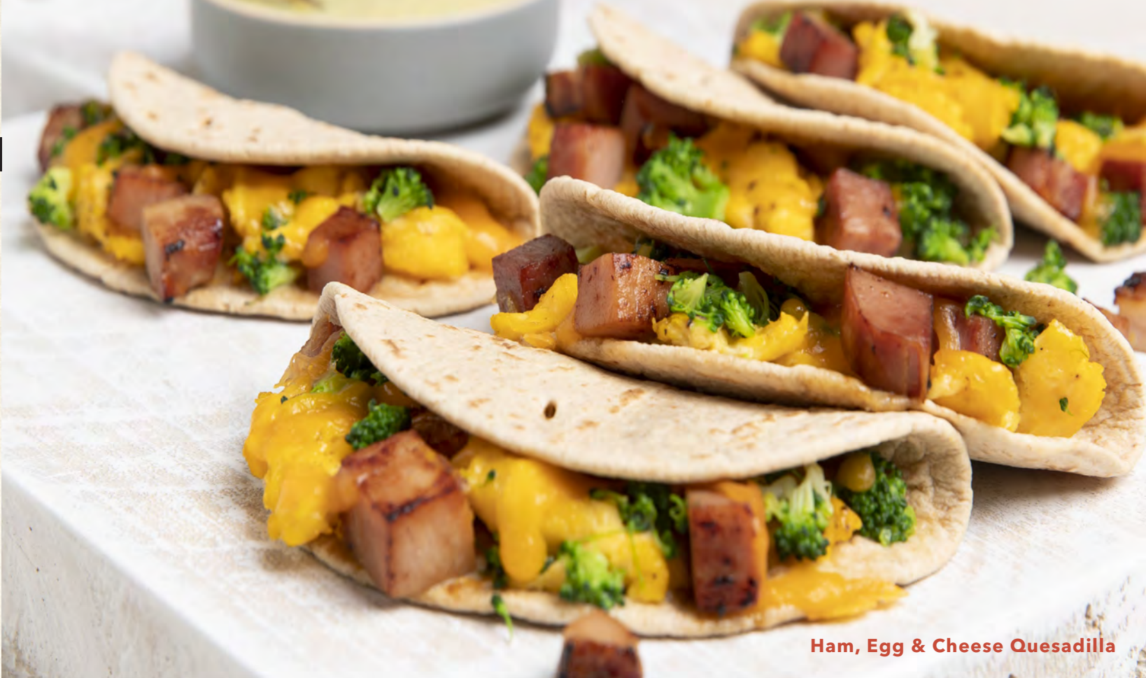
Ham, Egg & Cheese Quesadilla