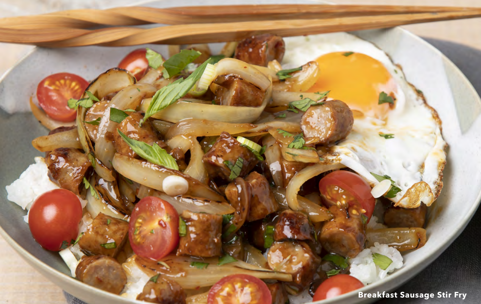
Breakfast Sausage Stir Fry

OPERATORS SAVE UP TO $250! DSRs EARN UP TO $500!