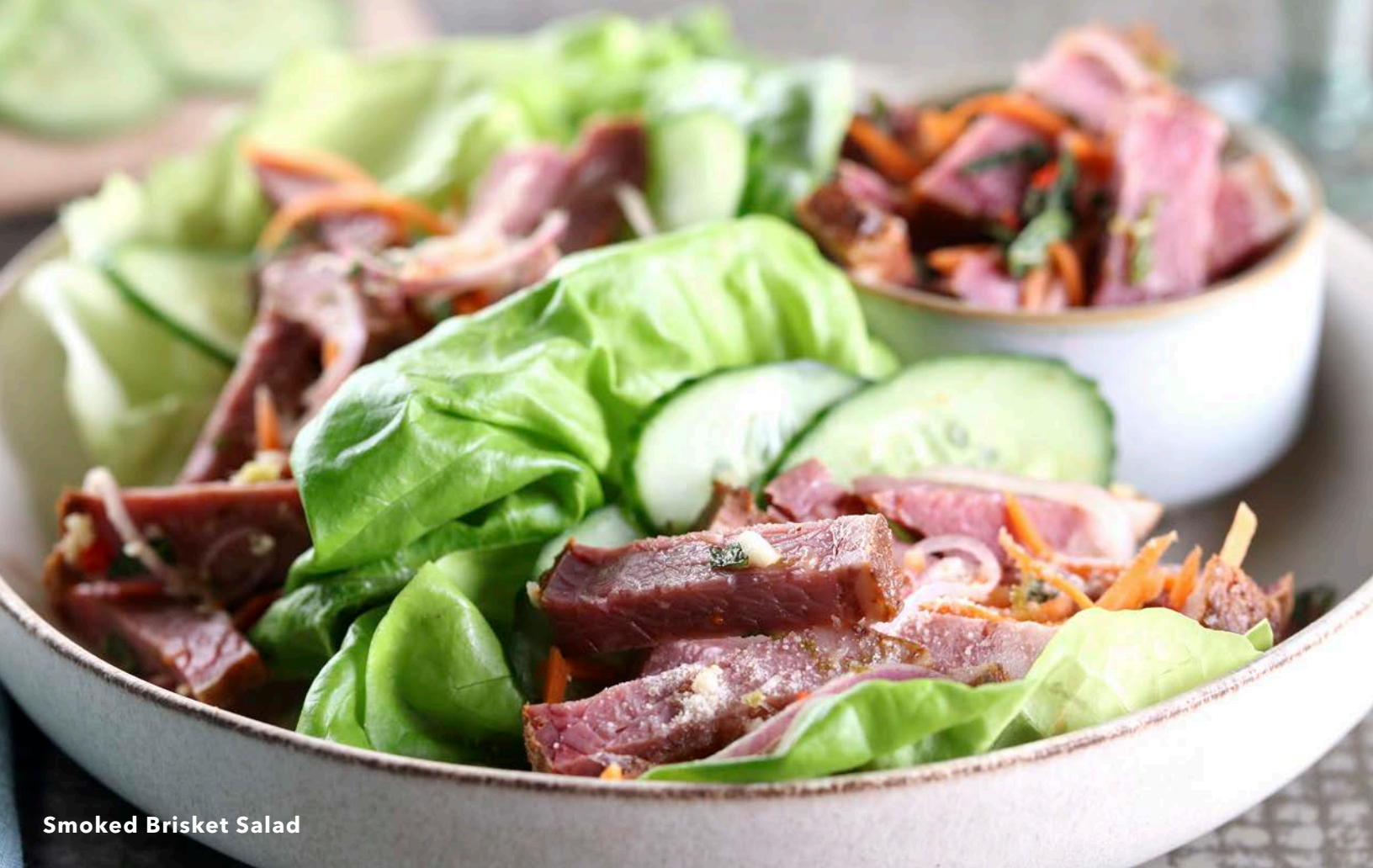
Smoked Brisket Salad