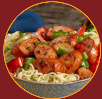
Ramen Noodles with Jalapeno & Cheddar Smoked Sausage