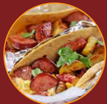
Smoked Sausage Tacos