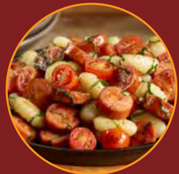
Gnocchi Skillet with Cheddar Smoked Sausage & Tomatoes