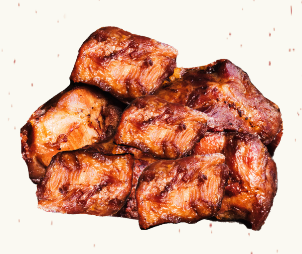
SNF KCWW Boneless Wings