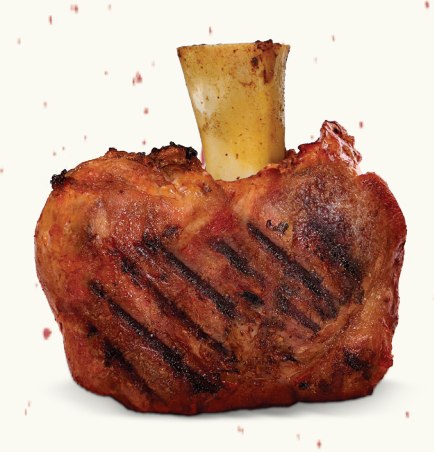
SNF KCWW Big Wings

$2 per case on new Boneless Wings & $5 per case on new Bone-In Big Wings. From August 29, 2022 through January 1, 2023.