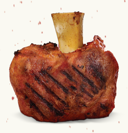
SNF KCWW Big Wings

52 per case on new Boneless Wings & $5 per case on new Bone-In Big Wings. From August 29, 2022 through January 1, 2023.